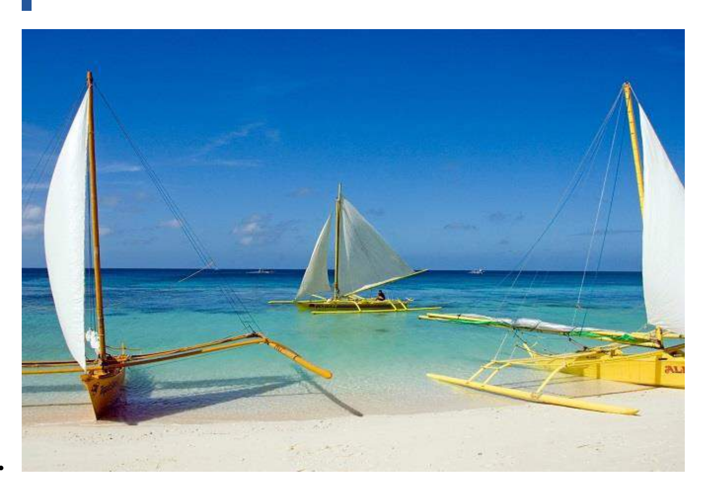
Sun, Sand, and Sea