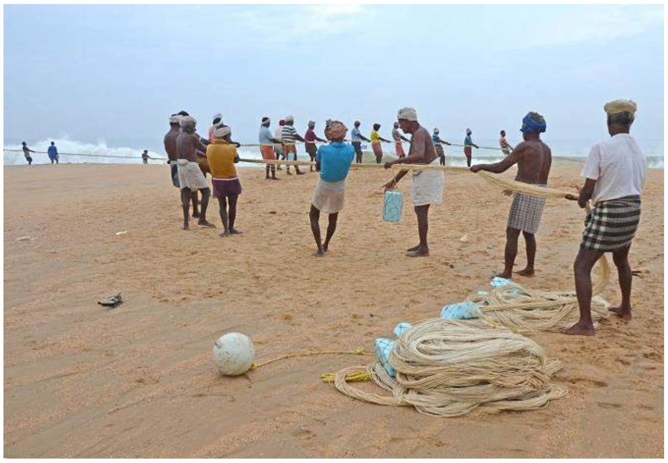
Pulling in the nets... and the catch!

At Chowara Beach, outside Trivandrum, several groups of men were hauling on ropes extending far out to sea. In a well-choreographed routine, the back marker controlled the team of workers, led the ritual chanting of encouragement and coiled the rope as the heavy fishing net was slowly pulled in. Teamwork at its best!