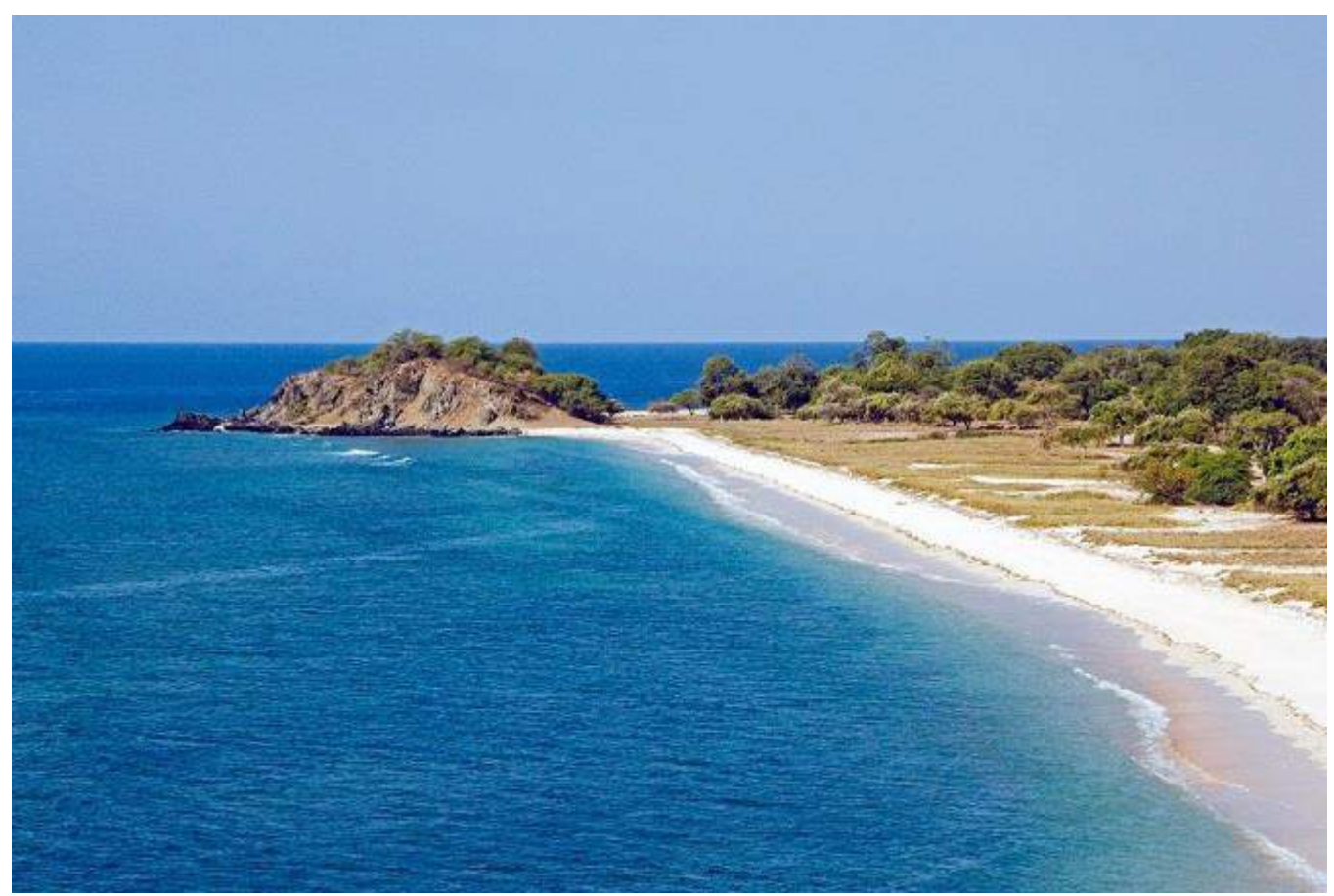
The One Dollar Beach - definitely worth the dollar!

Leaving Dili, we marvelled at the scenery as we passed a huge statue of Christ on the Fatucama Peninsula, dried out rivers, villages selling basketry, wooden houses with thatched roofs, stunning mangroves and the One Dollar Beach, so named because that is what the locals charge tourists to visit it!